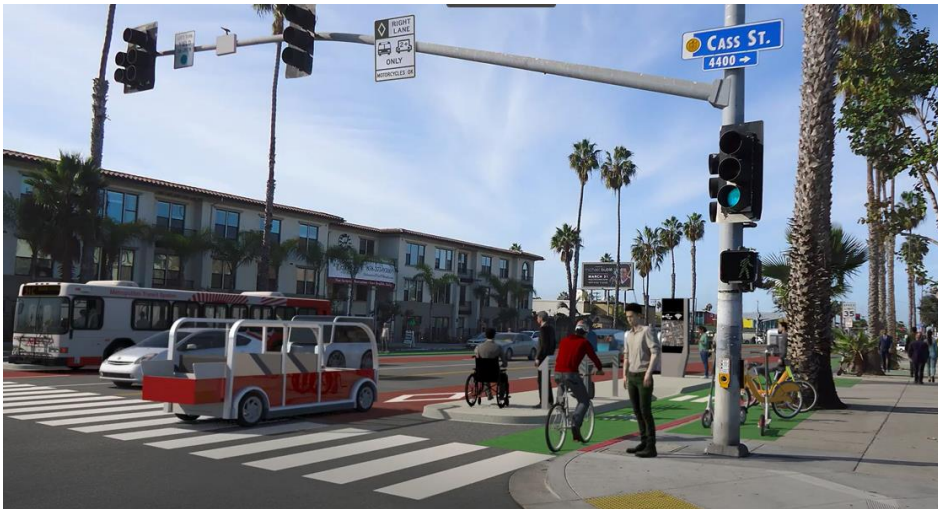
SANDAG's visual simulation of Balboa Avenue mobility hub amenities and services