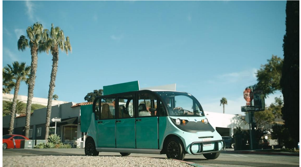
Example of a neighborhood electric vehicle (NEV)