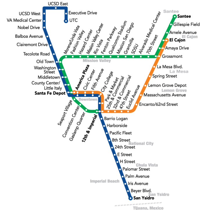
Regional transit connectivity via the "Blue Line" Trolley Extension