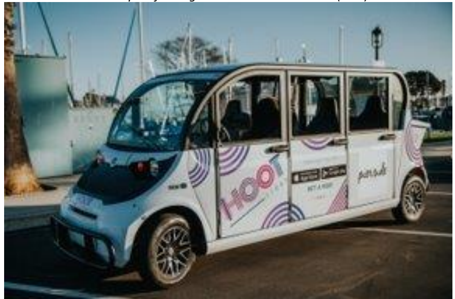
NEV vehicle from HOOT pilot in Oceanside