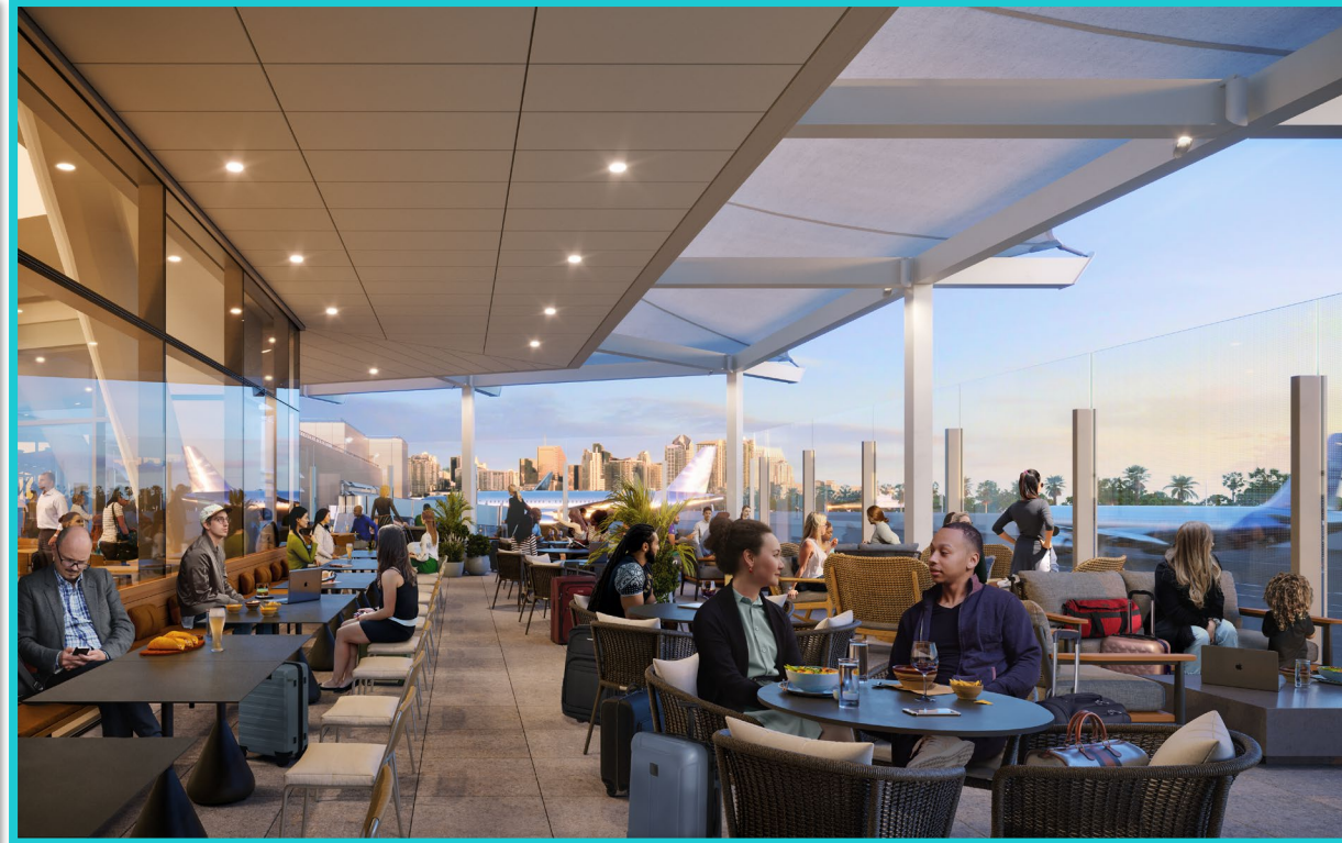
Outdoor Seating Terrace